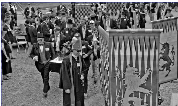
The funeral procession for the event was several blocks long, as close to 1,000 brothers and guests made their way from the Chapter House to the stadium.