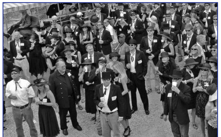
Following the traditional procession, brothers and guests enjoyed refreshments and entertainment inside the Undertaker's tent.